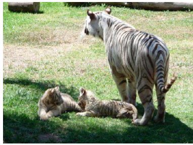
White tiger family

Safari Masai Mara displays animals from the African savannah.