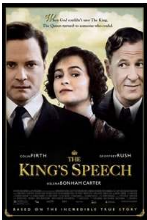
Best Picture: The King's Speech