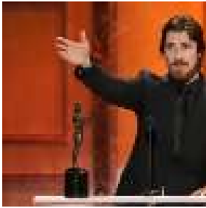
Best Supporting Actor: Christian Bale, The Fighter