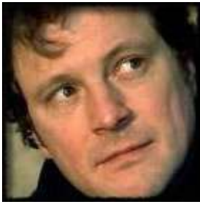
Best Leading Actor: Colin Firth, The King's Speech