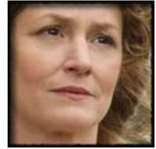
Best Supporting Actress Melissa Leo, The Fighter