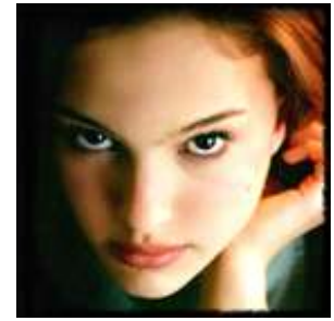
Best Leading Actress: Natalie Portman, Black Swan