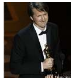
Best Director: Tom Hooper, The King's Speech