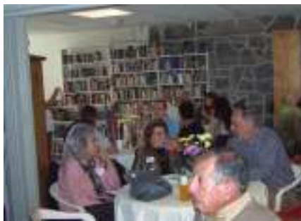
Guests at the swearing-in luncheon